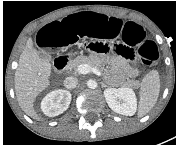
Fig. 2. Normal enhancement of right kidney two days after injury.

ultrasound was normal, with no evidence of scarring. He had 50 RBC's in his UA.