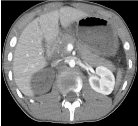
Fig. 1. Lack of enhancement of right kidney at initial presentation.

packed red blood cells. His heart rate stabilized with blood transfusion and IV fluid hydration. His creatinine was 0.9. Urinalysis revealed moderate blood with 17RBC/hpf. Review of the CT obtained at the outlying hospital revealed complete lack of enhancement in the right kidney, suggestive of devascularization of the right kidney (Fig. 1).