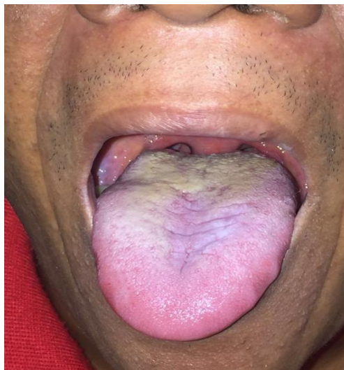
Figure 1: Asymptomatic white lesions formed by pseudomembranous edges located throughout the tongue.

As a habit, the patient reported being a smoker since his teenager years, smoking up to 10 cigarettes a day. The clinical examination revealed asymptomatic white lesions formed by detachable pseudomembranous edges, with a rough surface located throughout the tongue, including the right lateral border and the presence of a coating (Figure 1). At jugal mucosa, bilaterally it was observed