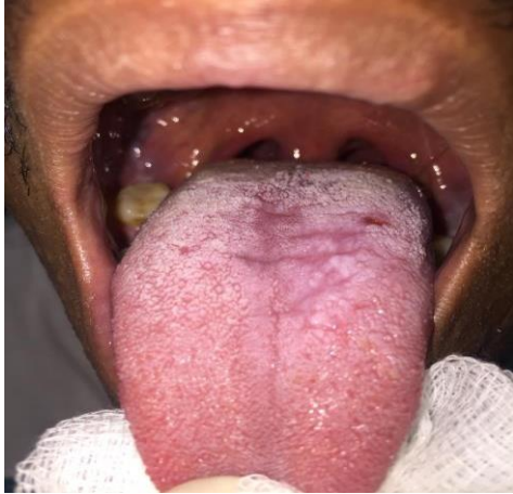
Figure 5: 4th session after topical application of VeglipR and laser therapy.