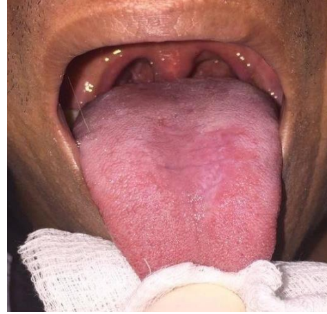
Figure 8: 5th session, where significant improvement was observed in relation to the initial picture.