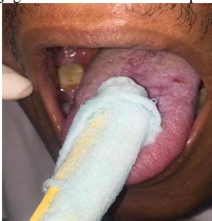
Figure 3: 1st session, tongue hygiene with 0.12% chlorhexidine digluconate.