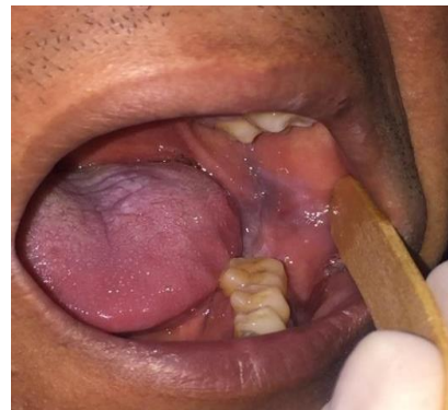
Figure 2B: Whitish stretch marks on the left jugal mucosa and brownish spots