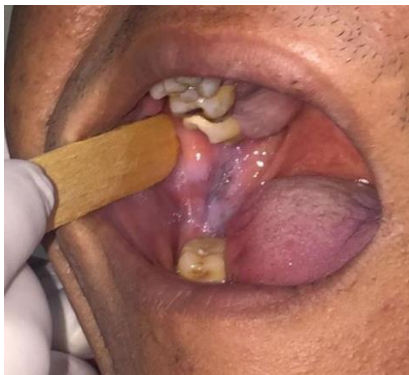
Figure 2A: Whitish stretch marks on the right jugal mucosa and brownish spots

Along with the use of the paste, the low intensity laser therapy was used, with beam area of approximately 0.05 cm 2 with wavelength 660 nm, power x, energy density 3 J / cm 2 and application of thirty seconds per point, without contact with the lingual surface and one minute pause in each shot three times (Figure 4). The patient received a daily visit, over a period of five days, totaling five sessions, resulting in the improvement of the stomatological condition (Figures 5 and 6).