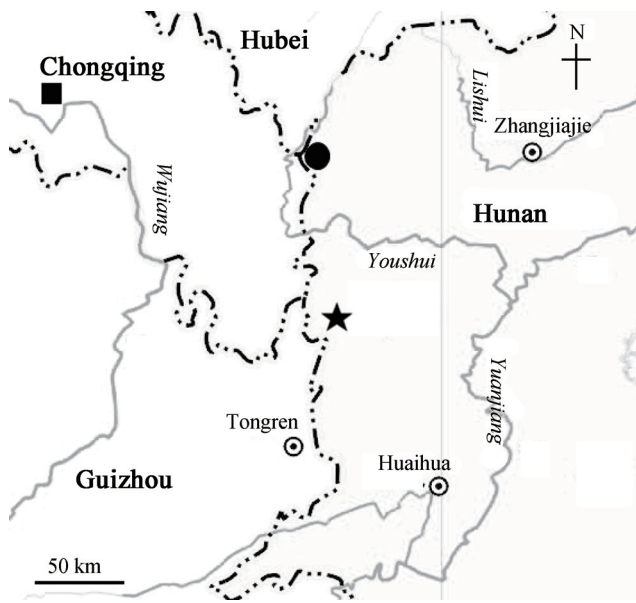
Figure 1 Distribution of Triplophysa erythraea sp. nov. (★), T. xiangxiensis (●), and T. rosa (■)