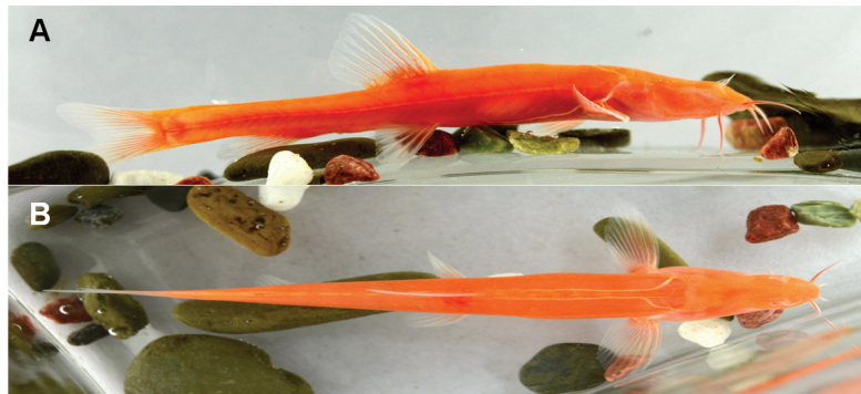
Figure 3 Live specimens of Triplophysa erythraea sp. nov.