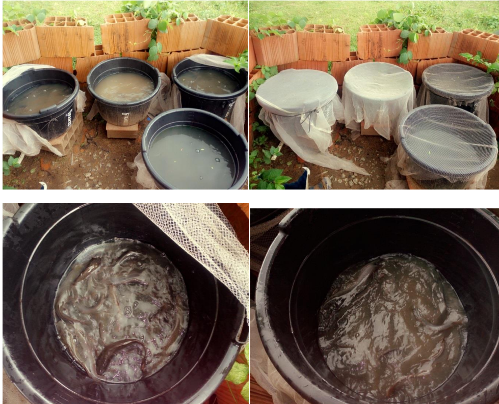
Plate 1: Images showing how fishes are been stocked in different circular plastic bowls.

and 5:00 to 6:00pm respectively. The feed for each treatment and its replicate were weighed in separate nylon for onward feeding. The feed particle size increased periodically as the fish grow. The fish were weighed using a weighing scale at the commencement of the experiment and on a weekly basis during the experiment and a calibrated measuring ruler (cm) was used to take the length of the fish at the commencement of the experiment and weekly basis for 12 weeks.