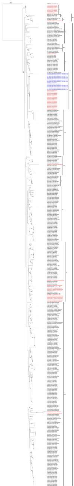
Fig. 4. The Maximum Likelihood Phylogenetic tree of the Microplitis sp. and Snellenius sp.

In our previous molecular-based studies, it was confirmed that the DNA barcoding of trichogrammatids (Hymenoptera: Trichogrammatidae) by using the mitochondrial cytochrome oxidase-I marker sequences was a practical approach for shaping molecular diversity (Venketesan et al. , 2016). In addition to that, the phylogenetic analysis was performed to identify and classify various species-groups of the genus Glyptapanteles Ashmead, 1904 (Insecta: Hymenoptera: Braconidae: Microgastrinae) (Gupta et al. , 2016).