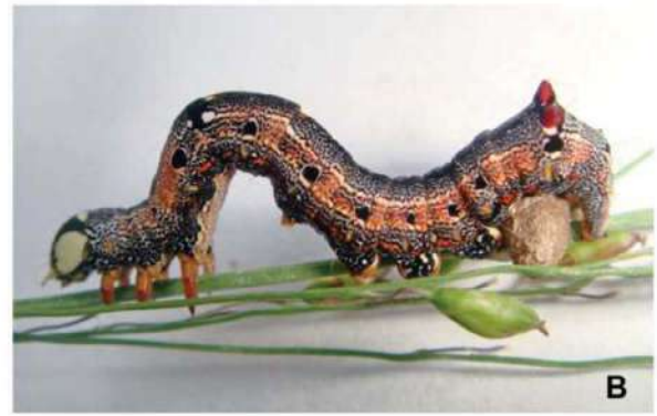
Fig. 2B. Parasitized Acanthodelta janata caterpillar with a cocoon of Microplitis maculipennis .

molecular based identification of insects using mitochondrial Cytochrome Oxidase I gene (COI) is gaining importance due to shortfalls in morphology-based identification (Erlandson et al. , 2017; Venkatesan et al. , 2016; Gupta et al. , 2016).