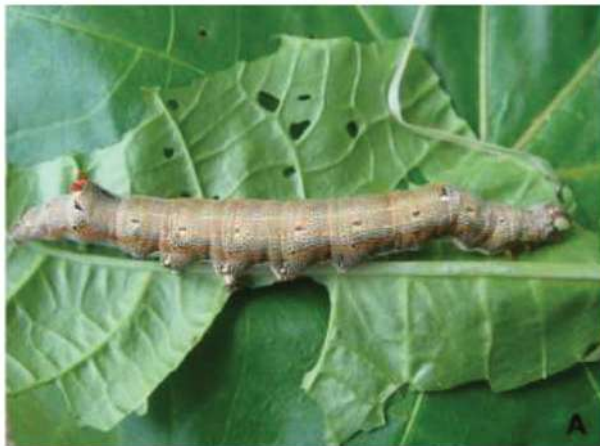
Fig. 2A. Unparasitized caterpillar Acanthodelta janata (Linnaeus).

molecular based identification of insects using mitochondrial Cytochrome Oxidase I gene (COI) is gaining importance due to shortfalls in morphology-based identification (Erlandson et al. , 2017; Venkatesan et al. , 2016; Gupta et al. , 2016).