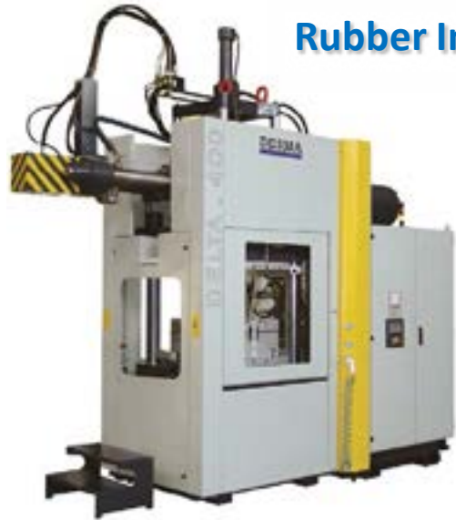
Rubber Injection Moulding