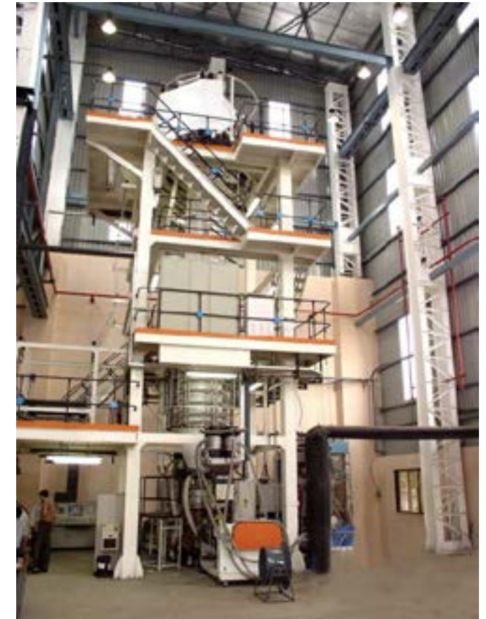
Blown Film Extrusion Plants