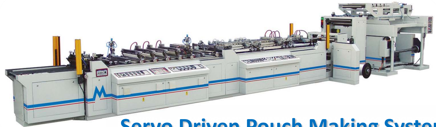
Servo Driven Pouch Making System