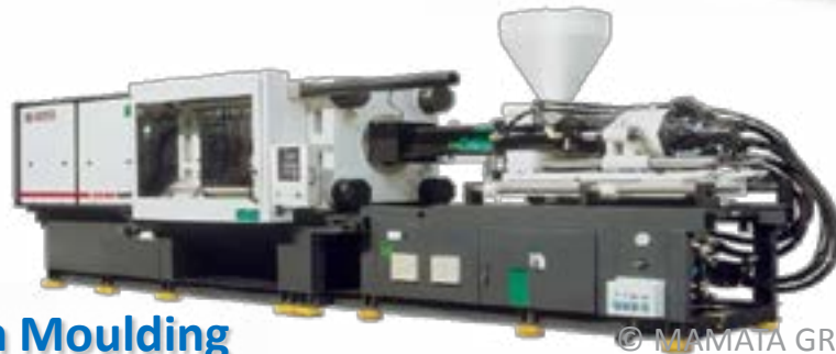
Plastic Injection Moulding