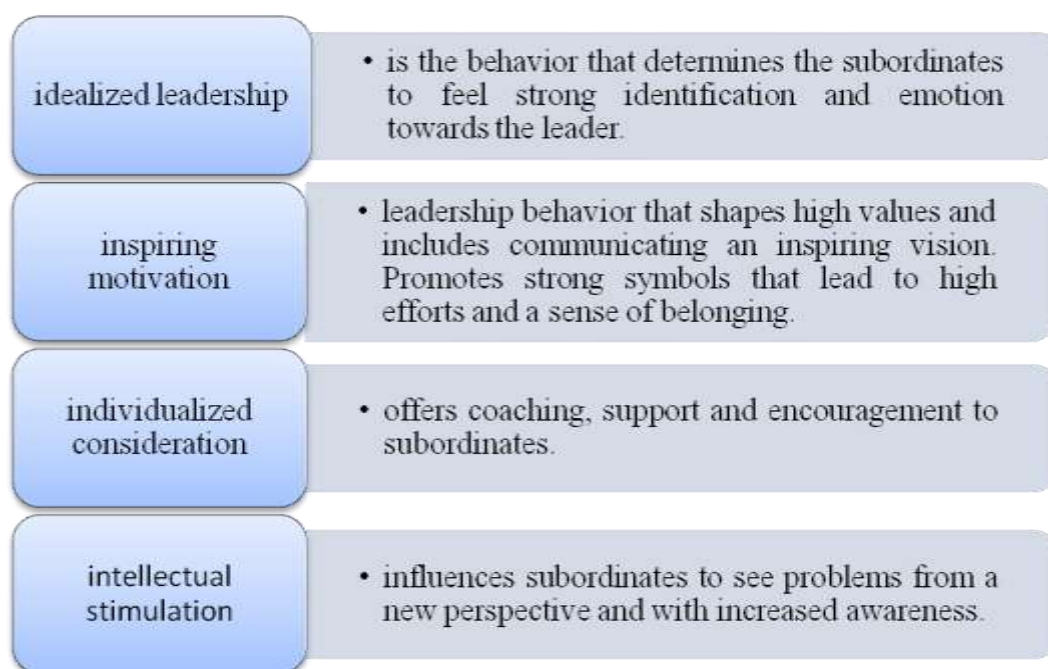
Figure 1. Types of transformational leadership behaviors