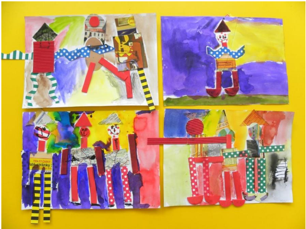
Figure 10 The Artwork of the Children.

On the described example we have tried to outline how to develop the visual literacy of pre-school children through the use of activities, oriented to the interpretation of visual art.