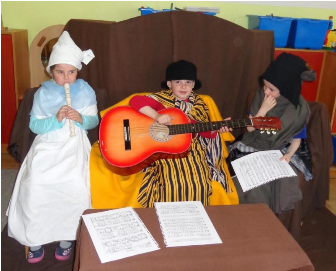
Figure 8 A Visual Interpretation of Painting I