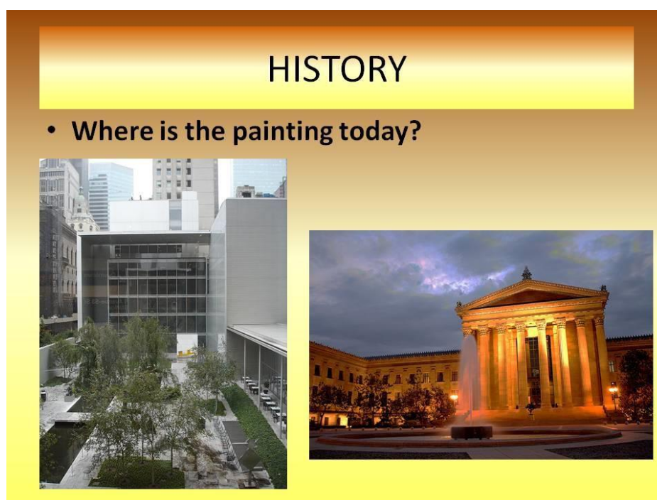
Figure 5 Multimedia Presentation for the Interpretation of Painting II

The interpretation of the content of the work of art began with its observation, without the children knowing the title of the artwork. They were