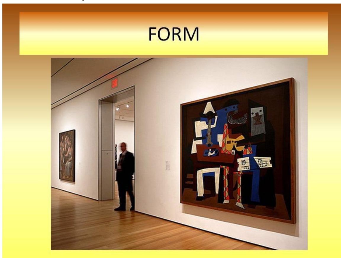
Figure 6 Multimedia Presentation for the Interpretation of Painting IV

she showed them the painting in a presentation from the New York Museum of Modern Art, where they could compare the size of the painting and the height of an adult man (Fig. 6).