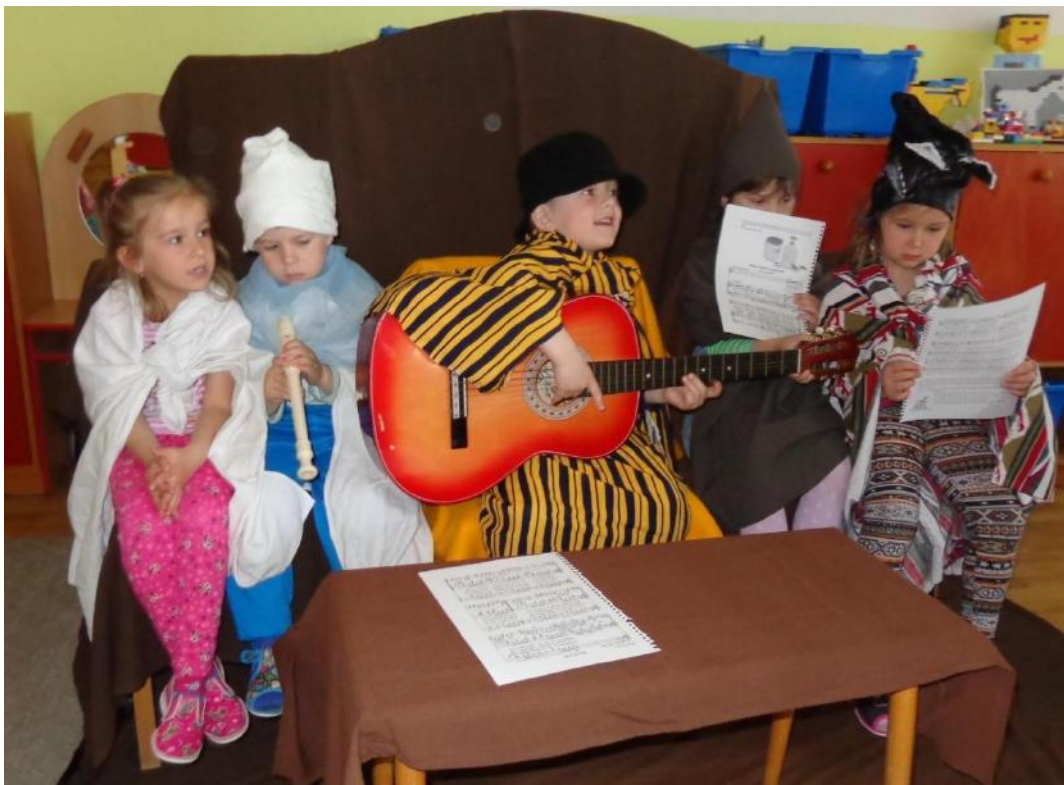
Figure 9 A Visual Interpretation of Painting II