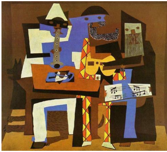
Figure 2 Three Musicians I

Three Musicians (Figs. 2,3) is the name of two similar works of art by Pablo Picasso, the most famous Cubist figure.