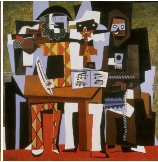
Figure 3 Three Musicians II 1

Objectives of the activity were (RQ2, RQ3):