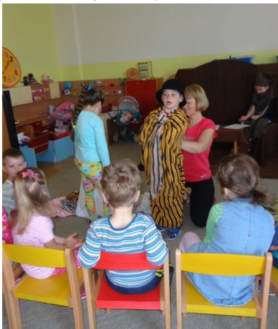
Figure 7 Preparation for a Visual Interpretation of the Painting

Another activity was the artistic interpretation of the painting, Three Musicians, through combined techniques - collages, drawings and paintings (RQ3). The children created figures of three musicians from the geometric shapes cut out of newspapers and colour paper sheets, with the crayons they drew their musical instruments and finished the backgrounds with aniline paints (Fig. 10). The children used A 4 sheets of card. It was important for them to have a wide variety of geometric shapes. They were also able to use parts of the puzzle to create the body of the musicians (Fig. 10 on the top left).