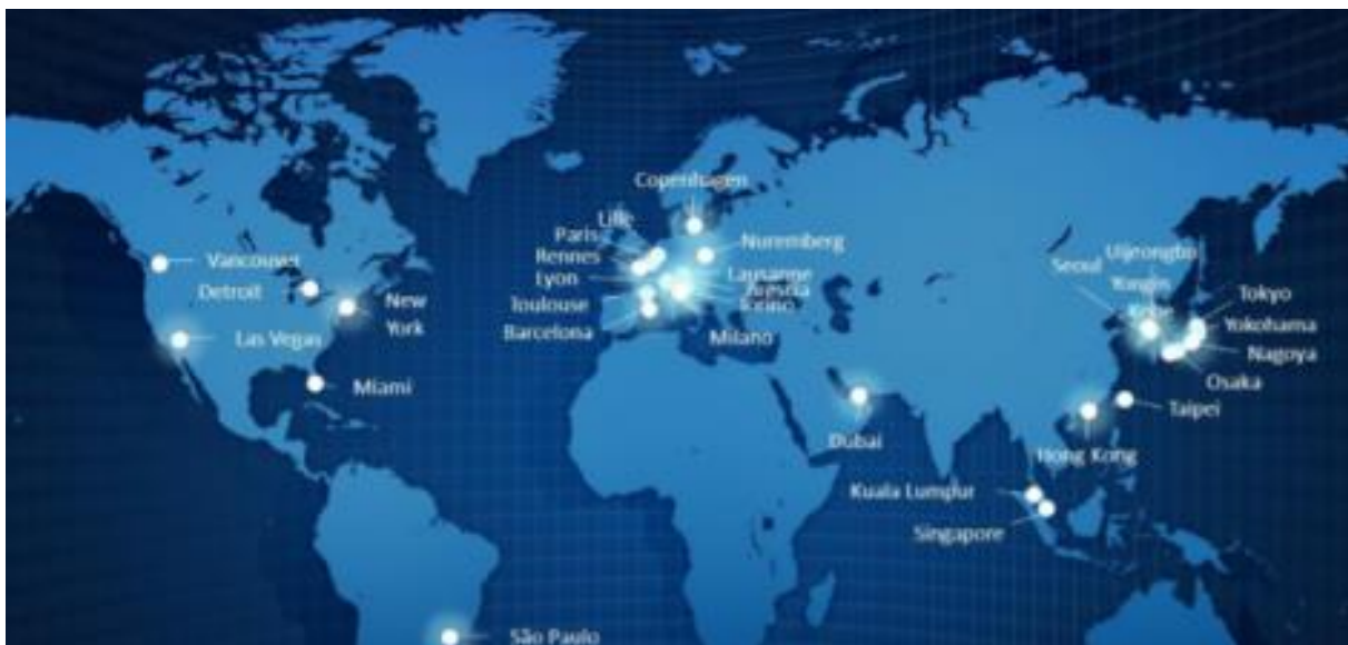
Fig. 1. Cities with automated metro lines as of 2013 [9]

Currently, worldwide in 19 countries and 42 cities, similar systems of automatic control of subway trains are operated. The total length of the lines on which these vehicles move is currently around 1000 km and includes 63 metro lines. Fig. 1 shows a map with selected cities in which automated train driving systems are active.