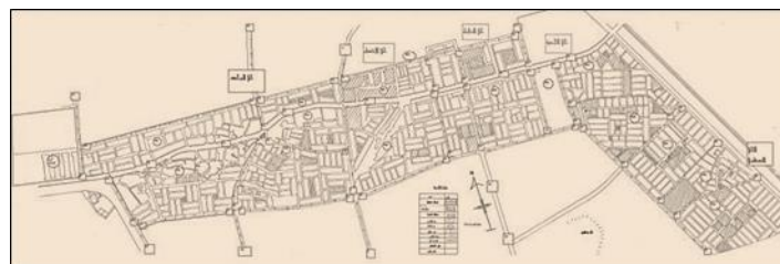
Fig. 2. Design of the urban area of Dujail 2017

The fourth phase: This runs from 1983 until the end of 2017, during which the city expanded in some of the agricultural districts (nine Tall Maskins, 16 Halis, 18 eastern orchards, 19 middle orchards, 20 northern orchards and 21 southern orchards), with an area of 382.5 ha, making the total urban area equal to 519.8 ha, with the total design area being 1,840.3 ha. This was the largest expansion of the city after the events of 1982, when it reached 1,703 ha. Meanwhile, the area used for the urban expansion of the city equated to 383 ha or 28.24% of the total design area, with the rest (71.76%) comprising agricultural land, 65% of which is arable and 35% unsuitable for agriculture. Given the exposure of the earth to direct sunlight, without cultivation and rising groundwater, this has caused significant amounts of salts from the ground to settle on the surface, rendering the land unsuitable for agriculture. By observing the stages of urban growth in the city, we find that, with the development of the means of transport, the city has grown along the main street with two large nuclei, allowing the city to grow in the final stage, as shown in Bład! Nie można odnaleźć źródła odwołania. , with a longitudinal form consisting of five neighbourhoods and 15 residential quarters spread sequentially along the street. This runs from the main city of Dujail to the Baghdad-Mosul Regional Road before reaching Dujail Railway Station as shown on the map.