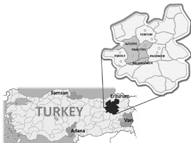
Figure 1. Locations of samples collected from the Province of Erzurum, and surroundings in Turkey.

Stool samples were obtained between 2016 and 2017 from small family farms in eight different centers, namely Erzurum center and Yakutiye, Palandöken, Aziziye, Aşkale, Tortum, Pasinler, and Hasankale (Figure 1). According to the rapid test kit results, stool samples that have none of the common enteric pathogens (rotavirus, coronavirus, Escherichia coli , Clostridium and Cryptosporidium ) were included in the study. Stool samples from a total of 72 calves with diarrhea were used in the study.