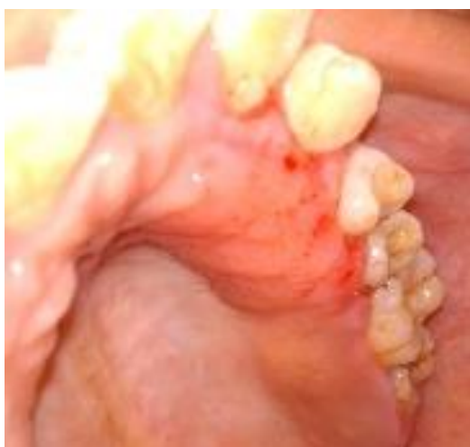
Fig.6: Post operative view palatal aspect of left maxillary gingiva after gingivectomy (after 1 week)