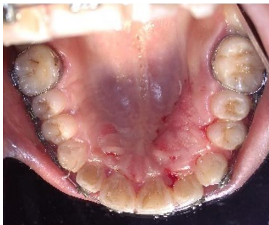
Fig. 10: Post operative view of left maxillary gingiva after 6 months