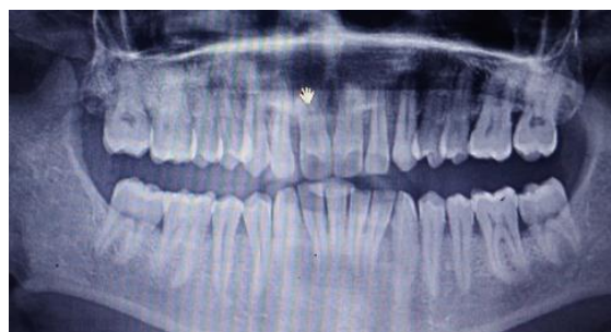
Fig. 4: OPG showing mild bone loss on the left side of the jaw