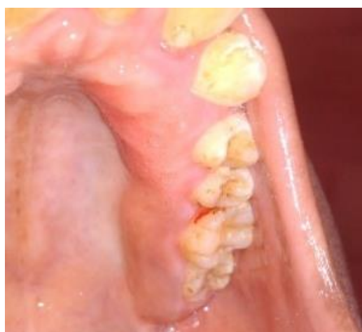
Fig. 8: Post operative view of left maxillary gingiva after one month