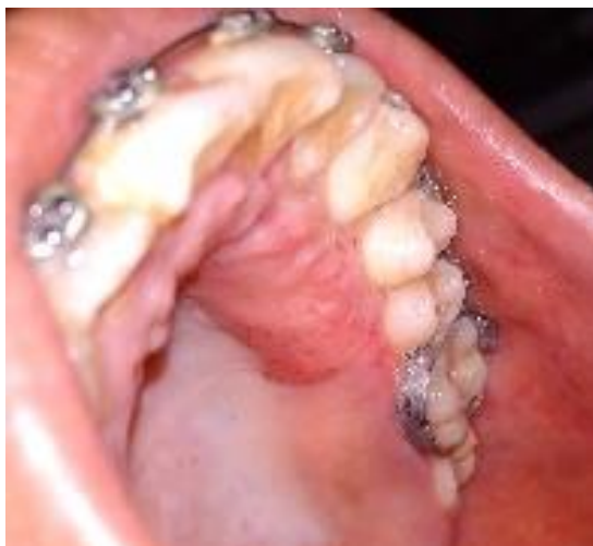
Fig. 11: Post operative view of left maxillary gingiva after 1 year