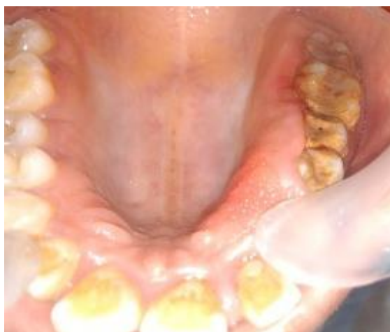
Fig. 1: Pre operative view Gingival hyperplasia on left side of maxillary arch

Based on the history and clinical examination pubertal unilateral gingival enlargement due to hormonal changes was given as provisional diagnosis as age of initiation correlates with that. Since there was absence of abnormalities in extraoral examination association of syndrome with this condition was excluded.