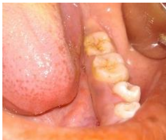
Fig. 9: Post operative view of mandibular gingiva after 1 month