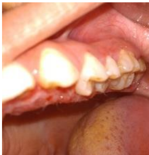
Fig. 5: Post operative view buccal aspect of left maxillary gingiva

Histopathological examination showed stratified squamous epithelium supported by fibrocellular connective tissue stroma. The stroma was composed of mild inflammatory cells, thick and thin bundles of collagen associated with numerous plump fibroblasts. These finding suggested the diagnosis of fibrous hyperplasia (Fig. 12 & 13).