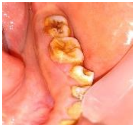
Fig. 2: Pre operative view Gingival hyperplasia on left side of mandibular arch