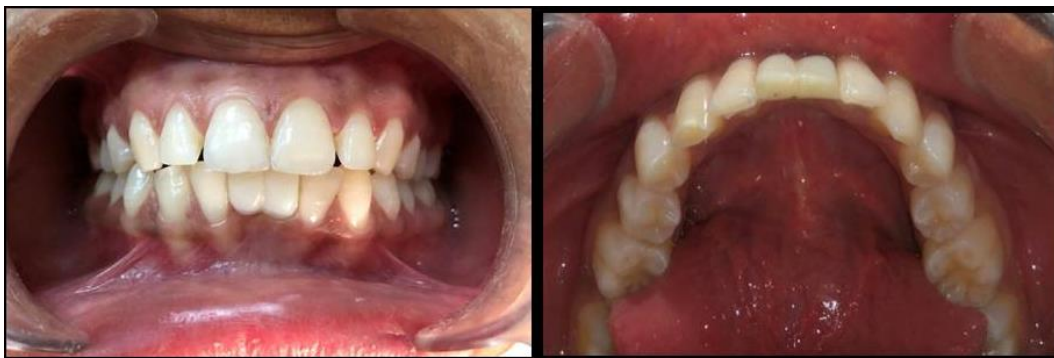
Fig. 3: Final intraoral view of the finished bridge