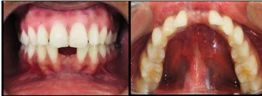
Fig. 1: Preoperative frontal view with a missing mandibular central incisors