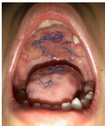
Fig. 4: Pedicle divided and most of the pedicle was repositioned into the donor site