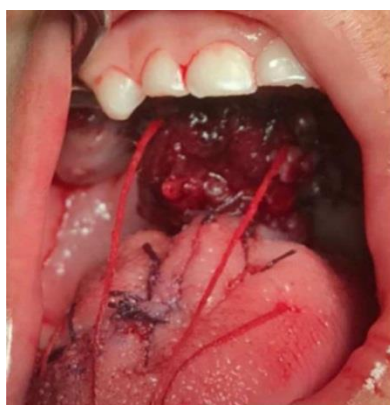
Fig. 3: Posteriorly based tongue flap of adequate breadth is raised, rotated, and carefully sutured on the defect