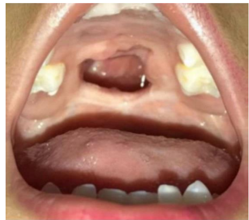
Fig. 1: A Giant palatal fistula size 2.5 cm X 2.5 cm post cleft palate surgery

palate extensively around the lesion. A peri-fistular incision was made and the defect margins were properly de-epithelialized for the acceptance of the tongue flap. (Fig. 2) Incisions were now made at the lateral margins parallel to the gum in the mucoperiosteum to enable adequate mobilization, dissection and suturing of the nasal layer without tension. A posteriorly based tongue flap of adequate breadth was raised, rotated, and carefully inset into the defect (Fig. 3). This was the only difficult part of the procedure. Three weeks later under general anesthesia, the pedicle was divided. A small open area was found posteriorly, which was refashioned and the residual pedicle was sutured; not more than two or three sutures were required. There were no intra operative or postoperative complications. The fistula was successfully closed (Fig. 4) and the child was put to speech therapy in anticipation of some improvement of speech, the extent of which in most cases is unpredictable.