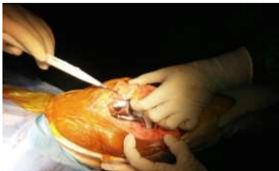
Fig. 1: Patellar rim cauterization