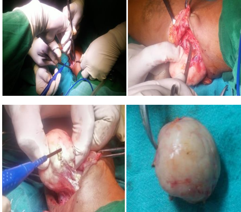
Fig. 5: Excised cutaneous mass from right forearm