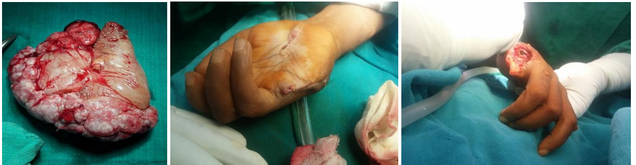
Fig. 6: Excised fungating mass along with right little finger from right hand