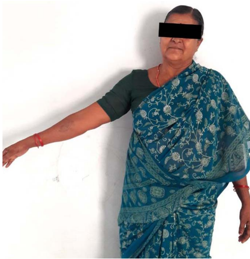
Fig. 4: Abduction before MUA