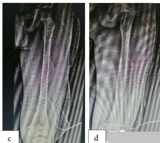
Fig. 3: a & b. Range of motion after plate removal; c & d: Postop radiographs after plate removal at 1 year from index surgery