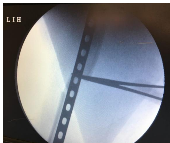
Fig. 1: Intraoperative image for plate positioning

Follow up visits at clinic were scheduled around 2 weeks, 6 weeks, 3 months, and 8 to 12 months. Radiological union was defined as presence of bridging callus across 3 cortices in orthogonal radiographs. Patients could bear weight without support when radiological union was achieved. We advised avoiding sports for 6 months (depending on the size and quality of callus). We advised implant removal approximately 1 year after injury. Delay in hardware removal is associated with bone overgrowth over the plate, making the surgery more difficult. Patients were advised to avoid strenuous activities for a period of at least 6 weeks after implant removal.