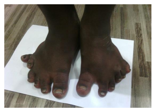
Fig. 1: Polydactyly of both the feet

Laurence-moon (Bardet) Biedl syndrome is a rare disorder first defined by Bardet in 1920.<sup>3</sup> BBS is distinguished from the much rarer Laurence-moon syndrome, in which retinal pigmentary degeneration, mental retardation, and hypogonadism occur in association with progressive spastic paraparesis and distal muscle weakness, but without polydactyly.<sup>4</sup>