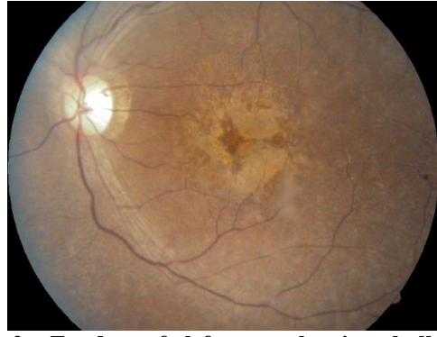
Fig. 2: Fundus of left eye showing bulls eye maculopathy