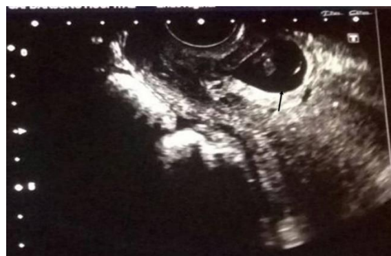
Fig. 1: TVS scan showing gestational sac implanted over previous scar (indicated by black arrow)

120/min, with no orthostatic hypotension. Abdomen was soft, non-tense, non-tender with no guarding or rigidity. On speculum examination, old clotted blood was seen with no active bleeding. Laboratory investigations reported Hb-12.8mg/dl, TLC-7000/mm 3 , platelet count-2.60L with liver function test, kidney function test and coagulation profile to be within normal limits. She was then taken for emergency laparotomy because of high chances of rupture of caesarean scar pregnancy. Intraoperatively, previous scar was found to be thinned out with only the serosal layer seen to be covering the fetal tissues implanted in the uterine scar, caesarean scar tissue with the gestation sac was removed. Uterus was closed in layers and foleys' catheter with bulb inflated to 5 cc was left in situ so as to drain out any collections in the cavity. Foleys was removed 24 hour postoperatively. Her post op period was uneventful and patient was discharged on 4 th postoperative day. Histopathology report showed multiple grey brown soft tissue measuring 4×3×1 cm and section examined showed features of products of gestation.