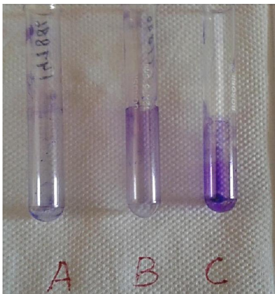
Fig. 3: Tube method of biofilm production-A; Negative control; B: Test; C: Positive control