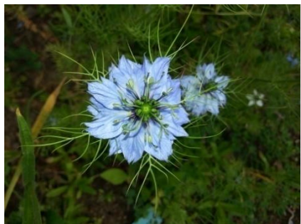
Black cumin plant flower

Although there were more than 400 herbs in use before Prophet Muhammad (pbuh), and recorded in the herbals of Galen and Hippocrates, black cumin or black seed was not one of the most popular remedies of that time. Since black seed is now considered a "remedy of the Prophet (pbuh), its usage and popularity have increased significantly. Today due to findings of extensive modern research carried out in various parts of the globe, many modern scientists classify it as all-in-one therapy, cure-all herb, a genuine universal remedy or a magical herb.