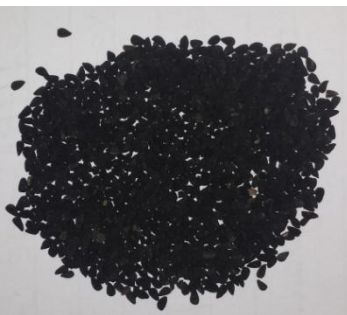
Black cumin seed