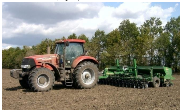
Fig. 1 - Mechanical seed drill CPH 2000 for direct seeding (No-Till) aggregated with a tractor Case Puma195

The mechanical seed drill CPH 2000 of direct seeding with an operating width of 6.0 m was aggregated with the tractor Case Puma 195 (Fig. 1).