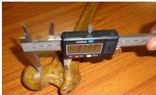
Fig. 5: Length of neck posteriorly