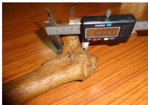
Fig. 6: Width of neck supero inferiorly