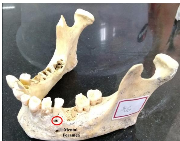
Fig. 4: Accessory mental foramen (circled) found antero-superior to main mental foramen near the canine root