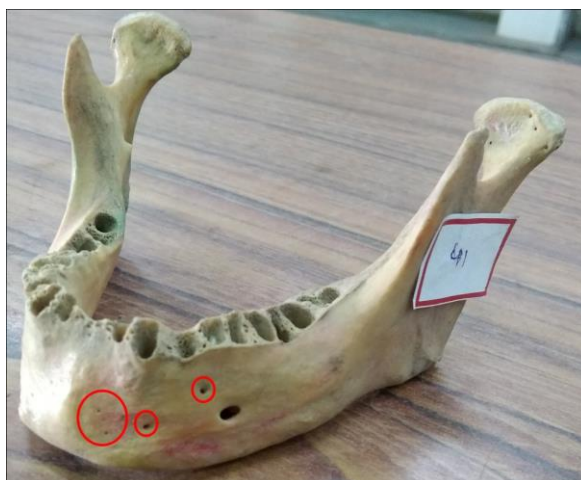
Fig. 3: Five accessory mental foramina (circled)