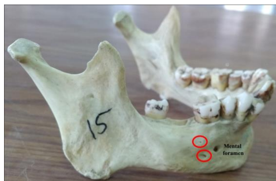
Fig. 5: Two accessory mental foramina (circled) found postero-superior and postero-inferior to main mental foramen