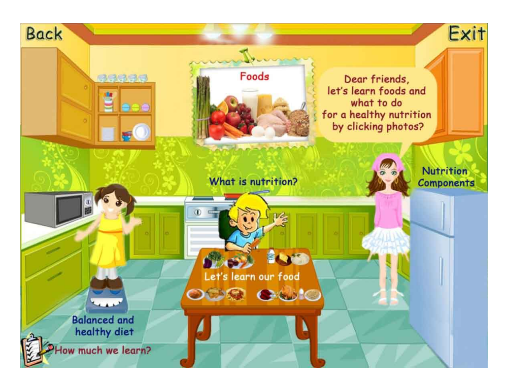
Figure 2: General outlook of the software.

THE EFFECTS OF MULTIMEDIA LEARNING MATERIAL ON STUDENTS' ACADEMIC ACHIEVEMENT AND ISSN 1648-3898 ATTITUDES TOWARDS SCIENCE COURSES (p. 608-621)