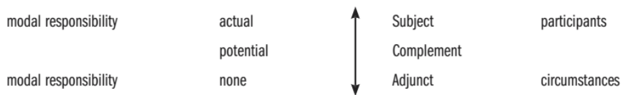
Fig. 1-2 Degree of Interpersonal (Halliday, 2014:26)

Because they function as ‘circumstance’ in the transitivity structure of the clause, anding-andingen was referred as circumstantial Adjuncts. These are experiential in metafunction. Halliday (2014: 154) defined that an Adjunct is an element that has not got the potential of being Subject; that is, it cannot be elevated to the interpersonal status of modal responsibility. This means that arguments cannot be constructed around those elements that serve as Adjuncts; in experiential terms, they cannot be constructed around circumstances, but they can be constructed around participants, either actually, as Subject, or potentially, as Complement. They are three degrees of interpersonal ranking or elevation in the clause, as shown in Figure 1-2: Subject – Complement – Adjunct.