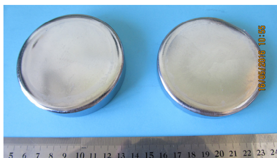
Fig. 3. The distillates of the refined ancient lead by the weight of ~ 1 kg each.

The operation of the device for lead refining by vacuum distillation consists as follows. The initial lead was pre-warmed and subjected filtration under vacuum. Then, the filtered lead weighing about 1.5 kg was placed in the crucible 2, the device chamber was evacuated and supported under a pressures of not more than 10^{-1} \text{ Pa} during refining. Lead melt was heated up to 1220 K, then it was evaporated and collected in the condenser 1 at a temperature about 1120 K in the form of refined metal B. The removal of low-volatile impurities (Cu, Fe, Si, Ni, Co, V, Cr, Au, Ag, Al, Tl, Sb, Sn, Mn, etc.), remaining in a lead residue in the crucible 2, was occurring during evaporation of lead to 95% of the initial charge. Volatile impurities, that partly transferred into the condenser together with lead during its condensation, were removed through a hole 4 in the condenser due to the exposure of purified condensate during the refining process (~ 5 hours) at a temperature ( T_{\text{cond.}} \approx 0.8T_{\text{evapor.}} ). The lead was subjected to a double distillation according to the described procedure. After each distillation process, the residue in the crucible was about 30...50 g. The Fig. 3 shows a photo of refined lead after distillation.