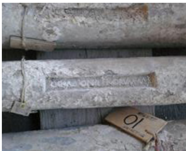
Fig. 1. The ingots of archaeological lead with stamps.

The subject of study was the ancient lead. The sunken 36-meter ship, which went from Spain to Italy, was discovered by archaeologists at the bottom of the Mediterranean Sea near the island of Sardinia in 1988. The more than 1,500 ingots of lead with weight of about \sim 33 kg each (Fig. 1) were on board among the transported cargo. The ship with the lead located on it, which spent about two thousand years on the seabed at a depth of 30 m, was perfectly shielded from exposure of cosmic rays.