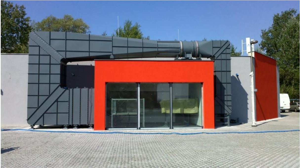
Figure 2. Headquarters of the Technology Transfer Center with the aerodynamic tunnel (29.07.2014)

Two reference pressure sensors, one barometric pressure sensor, and a temperature sensor are mounted in the tunnel. Ultimately, a modeling workshop equipped with cutting machines and a set of tools for model preparation will be established. Some of them will be created using a multicolor 3D printer.