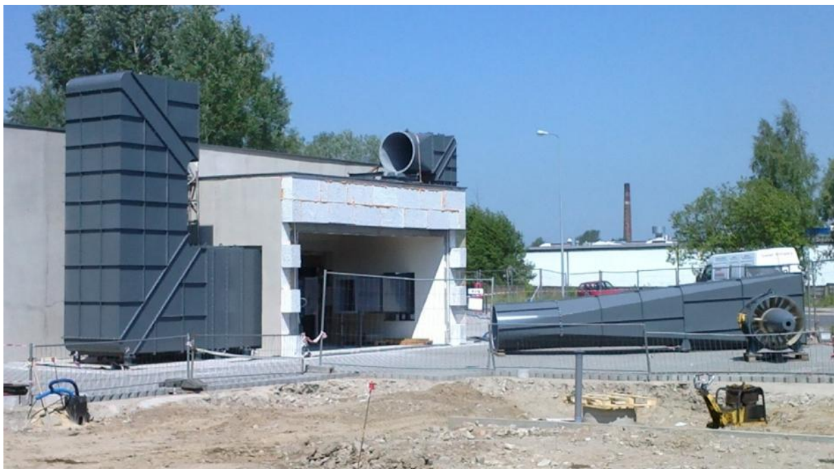
Figure 1. Construction of the aerodynamic tunnel and measuring chamber (27.05.2014)

The tunnel construction provides an even distribution of speed (with a tolerance of up to 1%) in an area that represents at least 80% of the cross-sectional area of the measurement space, in the vertical and horizontal planes, passing through its axis. The angle of deviation of the jet from the axis of the tunnel in both planes is less than 0.3. The construction of the measuring chamber is made of 10 mm thick clear plexiglass mounted in aluminum frames, which allows mounting of measuring objects. The chamber is connected to the tunnel structure via clamping grips.