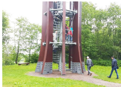
Figure 5: Climbing the Jurakalnis observation tower.