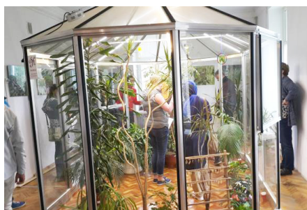
Figure 3: Observing butterflies, grown in Akmenė region museum.

Symposium participants also visited Gruzdžiai black ceramics workshops, some of them practically tried themselves the subtleties of clay processing. The participants had a perfect chance to get acquainted in detail with ceramic pottery production, they could also buy some things for themselves. A very attractive place to visit was Jurakalnis observation tower in Papilė. A spectacular scenery opens from that tower to Venta countryside reserve, Papilė town, Daubiškis village, Venta river curves and other. The form of the tower itself is very impressive, reminding a blossom of a flower. Besides, the tower is made of wooden and metal constructions.