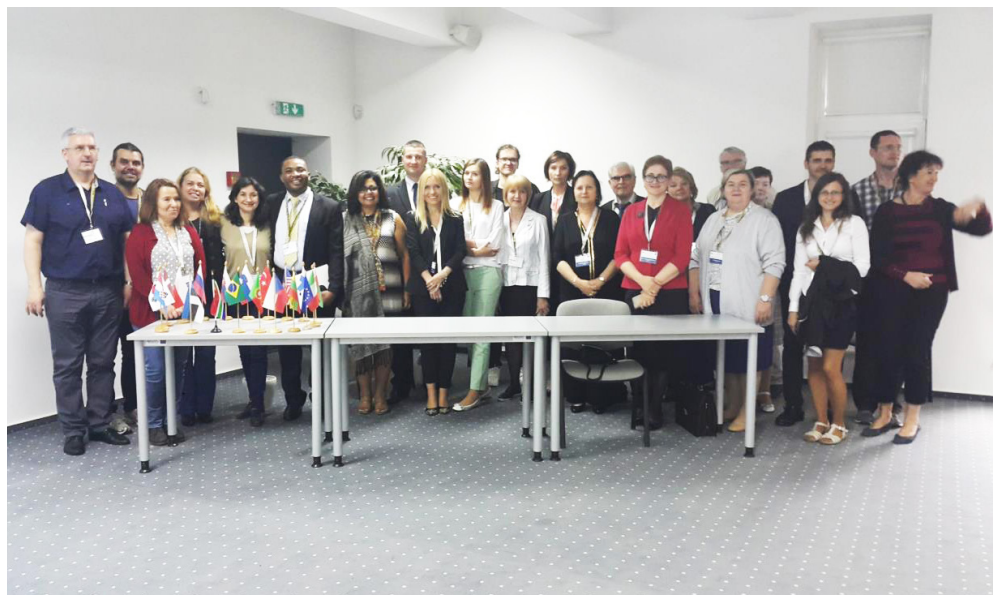
Figure 6: Symposium participant photo.

Before the symposium an article collection was prepared and issued. The full version of the publication is very freely available on the internet at https://www.academia.edu/33349325/SCIENCE_AND_TECHNOLOGY_EDUCATION_ENGAGING_THE_NEW_GENERATION . In the publication, a total of 35 short papers are published, in which various natural science and technology education problems are discussed.