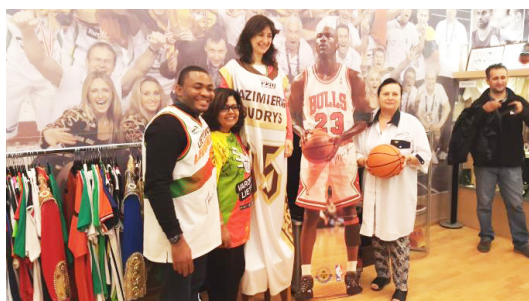
Figure 2: Symposium participants in Joniškis basketball museum.

The symposium participants also visited the Pharmacy museum in Vieksniai ( http://mazeikiutvic.lt/en/the-pharmacy-museum-in-vieksniai ). Pharmacy exposition, the first half of the 20 th century intellectual’s everyday life exposition is displayed at the museum. An extraordinary part of pharmacy museum is – a restored pharmacist’s herb garden, in which herb and spice plants are grown, educational practical activities are carried out. During these activities one can not only look round the garden, but also get acquainted with the features of the plants grown in it.