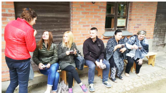
Figure 4: Herbal tea drinking ceremony at the pharmacy museum.