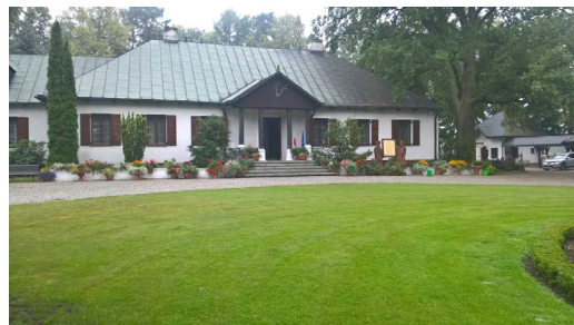
2 pict. House of Creative Work "Reymontówka" in Chlewiska