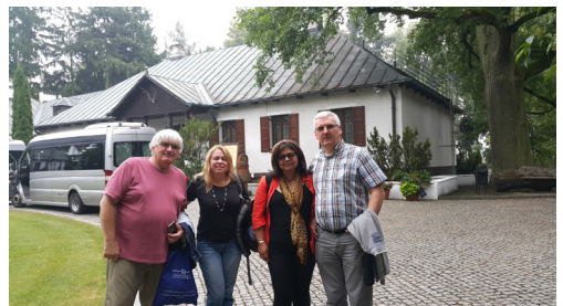
6 pict. Conference participants before out-door activities.

The Polish members who took part in the conference were from the following scientific resorts: University of Social Sciences in Łódź (1 person), Jagiellonian College – Toruń Higher School in Toruń (2 persons), Polish Air Force Academy in Dęblin (2 persons), University in Białystok (4 persons), Stanislaw Staszic University of Applied Sciences in Piła (1 person), The Maria Grzegorzewska University in Warsaw (1 person), Jan Długosz