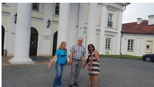
7 pict. Visiting university of Natural Sciences and Humanities in Siedlce