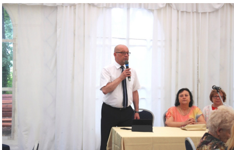
1 pict. Conference opening