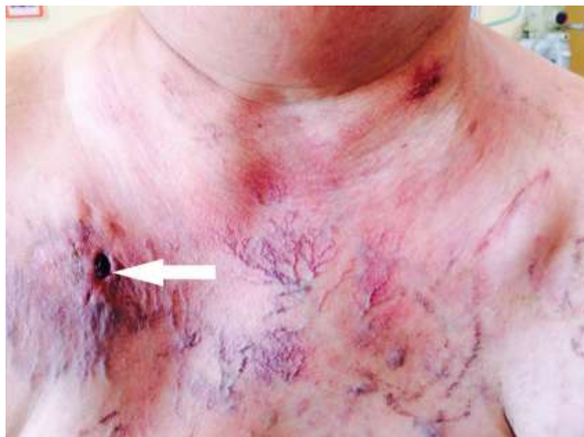
Figure 2. CVC exit site in CRT treatment in addition to anticoagulation in a 65 year old woman with breast cancer.