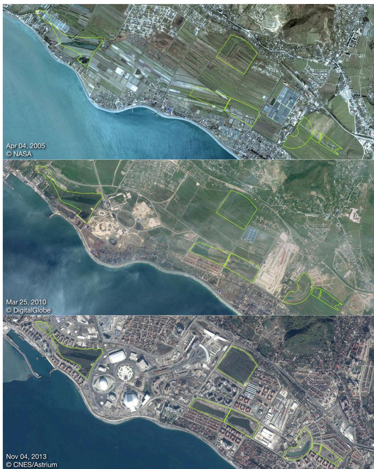
Fig. 3. Satellite images of Imeretinskaya Lowland in 2005, 2010 and 2013 (green line shows border areas of the Ornithological Park)

Despite this, though the species diversity of birds of the Natural Ornithological Park in the Imeretinskaya Lowland has become less than in the pre-Olympic period (2000 to 2009), it is still comparable in terms of species number. Census results of 2013 to 2016 indicate that the Imeretinskaya Lowland remains attractive to birds. Avifauna of the Ornithological Park is diverse and consistent with its specially protected natural area status.