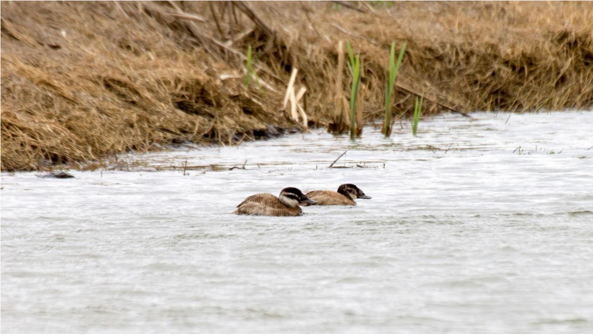
Fig. 2. – 2 ♀ white-headed ducks Oxyura leucocephala on one of the lakes of the Ornithological Park March 23, 2016