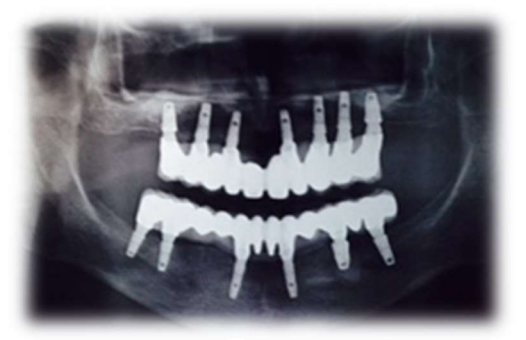
Figure 6: Final occlusal relationship