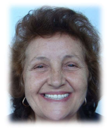
Figure 5: A 3 year follow up