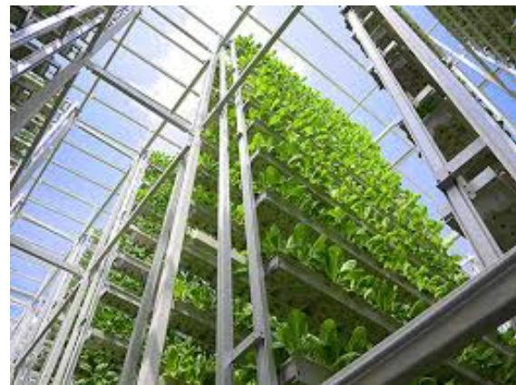
Fig 4 sky green vertical farm in Singapore

The farm can produce up to 30kg of vegetables a day, or 6 to 7kg for each square metre a month. In comparison, traditional farms yield 2 to 3kg for each square metre a month.