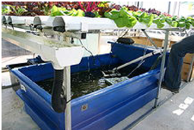
Fig 3 Filtered water from the hydroponics system drains into a catfish tank for Re-circulation.