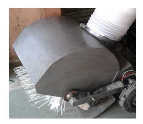
Fig. 4: Suction Mouth

The Suction Mouth is a part which provides Suction Surface Area and covers the required surface of the floor which is to be cleaned, to create the desired Suction Pressure. The Suction Mouth has two components connected to it: Brush and Dust Collecting Hose. This Suction Mouth is a combination of two Geometries: Half Cylinder and Rectangular Cross-section. The Suction Mouth is employed to cover Suction surface to make the suction effective.