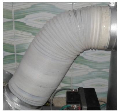
Fig. 5: Dust Collecting Hose

The Dust Collecting Hose is an important part as it is the only medium through which the Sucked dirt is sent to the Suction Cylinder. The Dust Collecting Hose is a flexible part whose length can be adjusted according to the desire.