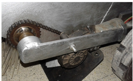
Fig. 3: Brush Motor

The Brush Motor is a D.C. operated motor, providing the rotary motion of the Brush. This Brush Motor has a rotary motion which is coupled to the Brush through the chain drive mechanism. This chain drive gives rotary motion to the Brush shaft, hereby rotating the brush.