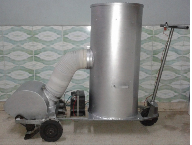
Fig. 9: Project model