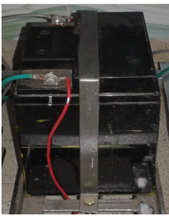
Fig. 8: Battery

The Battery used in this project is the main source of Power to run the Axial Flow Fan which is responsible for the production of Suction Pressure. The Battery used is of 12V/26Ah rating.