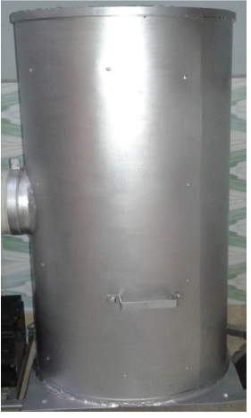
Fig. 7: Suction Cylinder