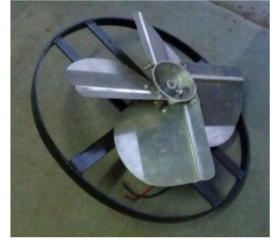
Fig. 6: Axial Flow Fan

The Axial Flow Fan is the main motor which creates lower pressure inside the Suction Cylinder resulting in Suction of the dirt. This Fan is fitted into the Suction Cylinder top. As the Fan rotates it produces Suction Pressure in the Suction Cylinder [1]. This Fan is also a D.C. operated Fan, operated by Battery.