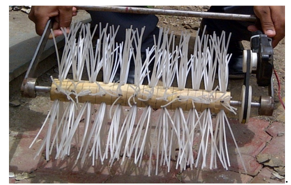
Fig. 2: Brush