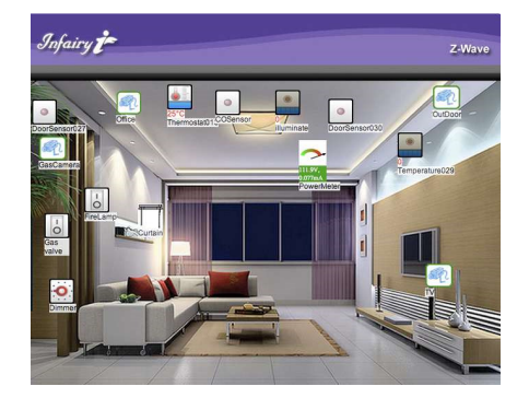
Fig. 3 Application of the z wave protocol and prediction algorithm

to control home appliances remotely. so that all the necessities of life becomes easier and fun, as the picture below is an example of a smart home whose device is connected with Z-Wave.