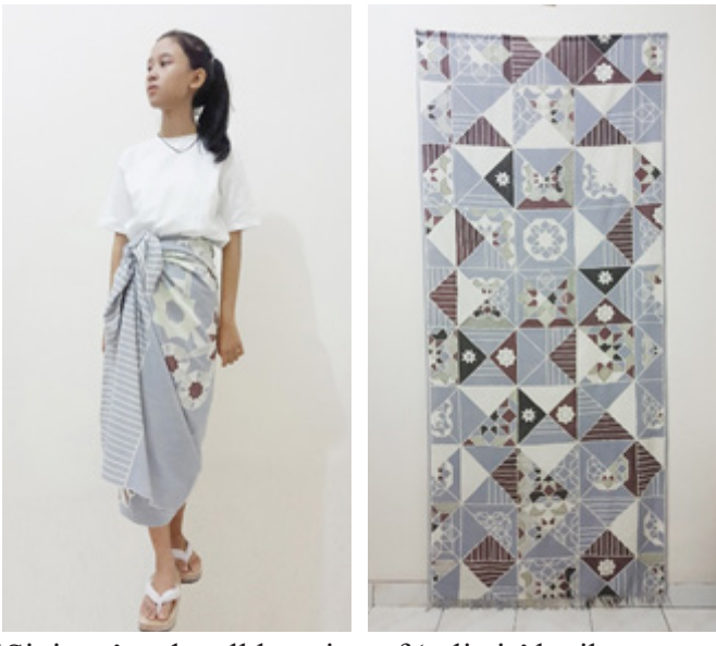
Figure 5'Sinjang' and wall hanging of 'tali air' batik stamp products