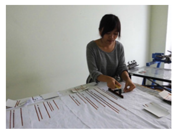
Figure 8 Batik process

The creative resource as respondents create sketches based