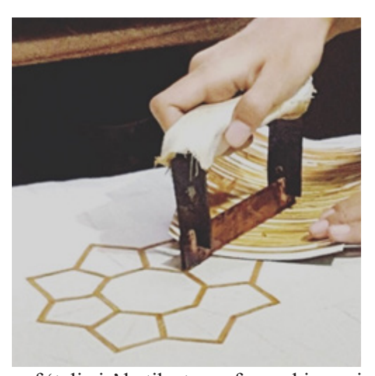
Figure 4 Utilization of 'tali air' batik stamp for making primary decorations

In the designing process, the objects that will be the ornaments