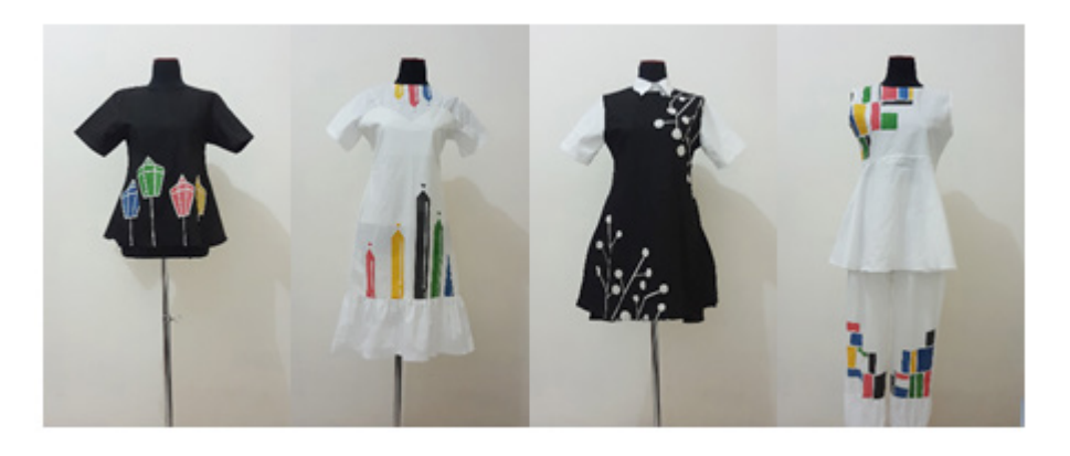
Figure 10 Prototype