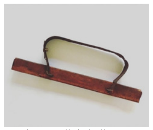
Figure 3 Tali air' batik stamp