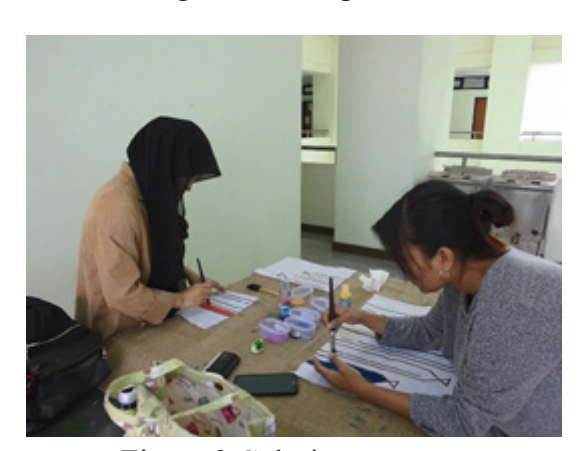
Figure 9 Coloring process