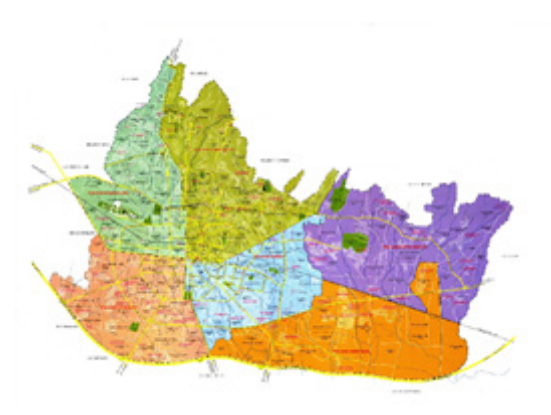
FIGURE 1 BANDUNG MAP

The scenery such as mountains and fields as well as its local plants and animals often become the object to create a product or creative works such as painting or batik patterns. Those objects go through deformation process which is influenced by the technique and the creativity of the craftsmen. The object, technique and creativity of the craftsmen will result a product or work which has