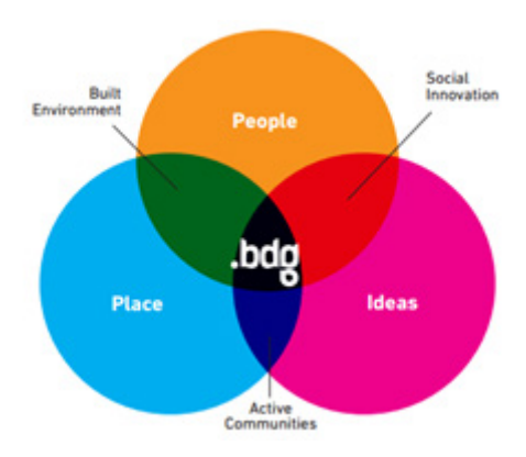
Figure 2 Diagram of Bandung creative city development

Empowerment is a process in which the people are supported in order to improve their welfare independently. In 2015, 72.04% from the total population of Bandung are people with productive