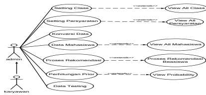
Figure IV-3 Use the Case prototype of the application of the Naive Bayes method in the selection process for prospective students who receive the Pakarti Luhur PPA AMIK scholarship.