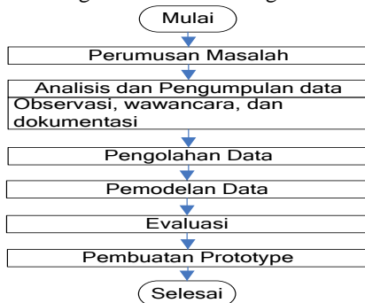
Figure III-1 Steps to Research Research Schedule

In this study the authors conducted data testing using academic reporting data and for testing the authors used the Naive Bayes method. Research Steps In creating a Model Determination System for PPA Scholarship Recipients Students the whole process must go through several stages. The steps at the research stage can be seen in Figure III-1.