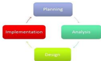
Figure II-1 SDLC Stages (Dennis et al, 2012).

Which in each process is carried out gradual improvement (Dennis et al, 2012) [3], we can see in Figure II-1.