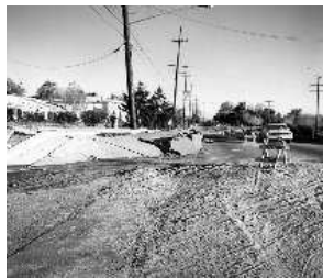
San Fernando 1971

caused by short circuit of electrical equipment, fires and explosions caused by damage to natural gas supply pipes [4].