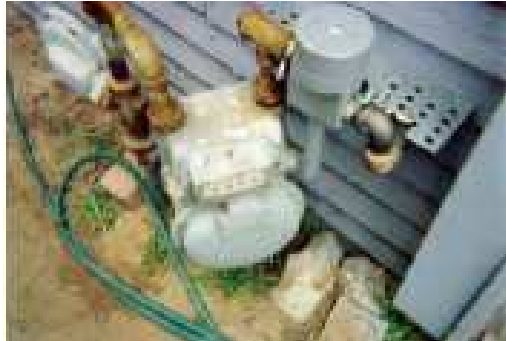
Figure 4. Automatic device (valve) to stop natural gas supplies [34]

The movement of structural and nonstructural elements with high massiveness produces the separation / detachment of pipes clamping elements that can or brake damage to that may cause the pipes damage or break. For this reason, measures are required to avoid IU- CNG full or partial exit from operation by interrupting the connections with external supply networks. Overall, IU-CNG pipeline rupture generates fire and / or explosion. Thus, in order to automatically interrupt the gas supply in buildings with high fire danger is recommended installing automated devices for interrupting the gas supply (Figure 4) in the supply grid. For buildings with low fire danger, there can be use manually operated closure devices [34].