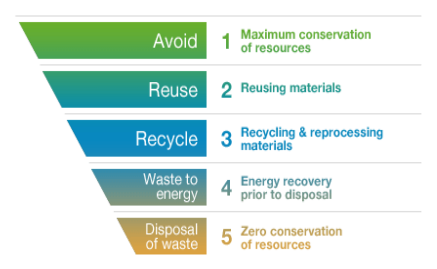
Fig. 2. Waste management hierarchy (Taha, 2015)

Utilization of 3R concept; reuse, recycle and reduction and these component can effectively minimized construction waste which was created onsite. It required the cooperation of all parties during design and construction stages. Thus, the components of different hierarchy may be different, but the 3R concept is necessary. However, Malaysia is still ineffective in the implementing of the construction waste management hierarchy which led to land disposal site.