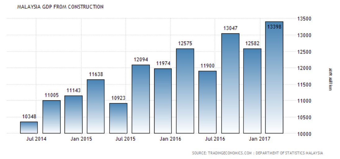
Fig. 3. The Contribution of the Construction Industry to the GDP

The construction industry in Malaysia continues to grow to achieve approximately 10.3 % in 2015 compared to 11.8 % in 2014. It grew 18.1 % in 2012 and 10.6 % in 2013; the number of project has achieved double-digit growth for three consecutive years. The Department of Statistics Malaysia reported the contribution of the construction industry to the GDP has increased dramatically as shown in Figure 3. From Figure 3, GDP from construction industry in Malaysia increased to 13398 MYR Million in the first quarter of 2017 from 12582 MYR Million in the fourth quarter of 2016. GDP From Construction in Malaysia averaged 9808.72 MYR Million from 2010 until 2017, reaching an all-time high of 13398 MYR Million in the first quarter of 2010.