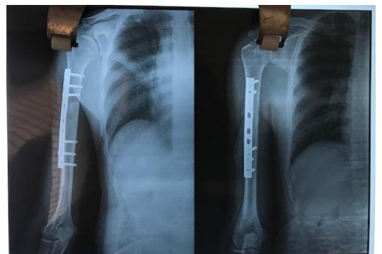
Fig. 9: 3 Months follow up