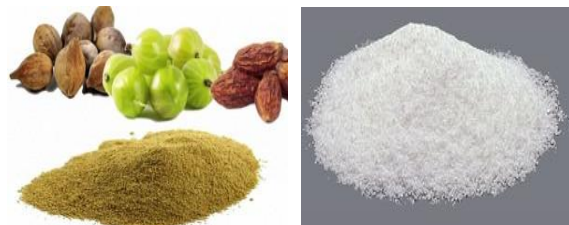
1. Triphala raw drug 2. Sodhita Tankana