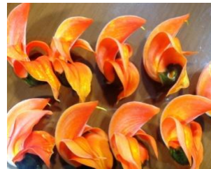
3. Flowers of Palash