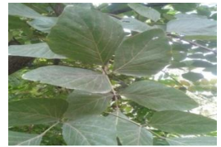
2. Leaves of Palash