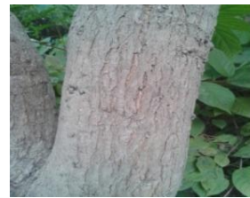
1. Stem of Palash