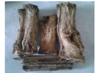
4. Root of Palash