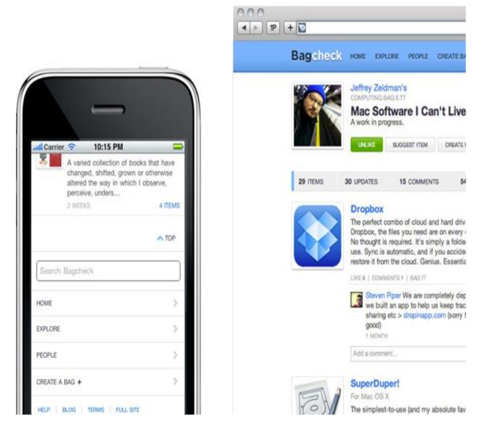
Figure 2 – Example of separate site (Wroblewski, 2011)

Separate mobile sites have their own URL (m. or mobile.) and typically provide a different content and behavior than the full website version. On mobile sites, the design privileges the most requested features in detriment of other less relevant content (Robbins, 2012). As a result, the two versions of the website deliver different experiences. Figure 2 shows an example of mobile site and its full version.