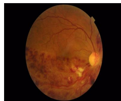
Fig. 6: Fundus photograph of Right Eye showing features of Inferotemporal Branch Retinal Vein Occlusion (BRVO)