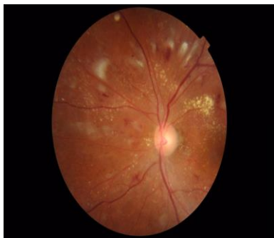
Fig. 1: Fundus photograph of left eye showing features of Grade 4 Hypertensive Retinopathy