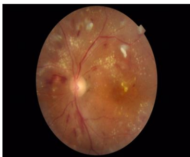
Fig. 4: Fundus photograph of Left Eye showing features of very Severe Non-Proliferative Diabetic Retinopathy