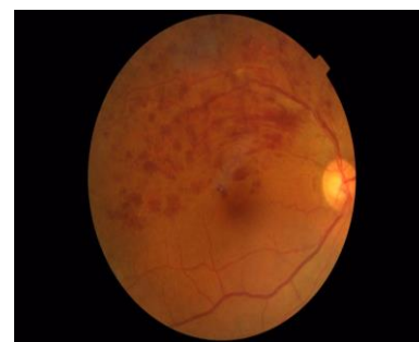
Fig. 7: Fundus photograph of Right Eye showing features of Superotemporal Branch Retinal Vein Occlusion (BRVO)

No retinal changes were seen in 47.62% of the patients. The commonest retinal change was arterial attenuation (28.57%) followed by dot and blot haemorrhage (21.90%), A-V crossing changes (20.48%), hard exudates (19.05%), flame shaped haemorrhage (42.56%) and macular edema (18.10%). However in 5.71% cases papilledema and in 5.24% cases ischemic optic neuropathy was observed. (Table 5).