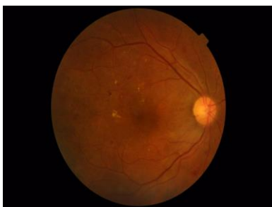
Fig. 2: Fundus photograph of Right Eye showing features of Mild Non-Proliferative Diabetic Retinopathy (NPDR)