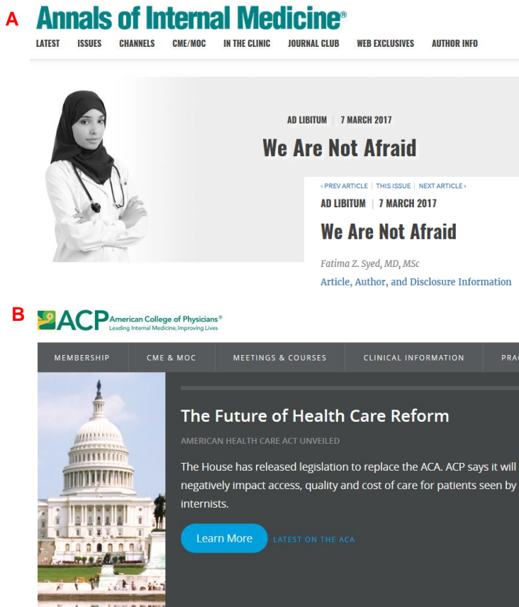
Fig. 9. Socio-Political Involvement of ICMJE and the ACP/AIM

and must thus be seen as being fully open and honest, accountable and transparent. As it currently stands, this is not the case. This paper serves a vote of no confidence regarding the ICMJE and thus its recommendations which are being imposed upon the global biomedical community.