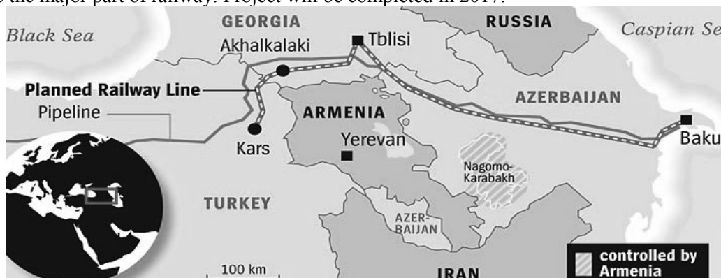
Map 5. Route of KTB Rail Project

KTB is a railway project to connect directly Turkey, Georgia and Azerbaijan (See Map 5). The total length of railway is 826 km and its total cost is around 450 million US$. Railway's 76 km will be built in Turkey, 259 km will be built in Georgia and the rest will be built in Azerbaijan. Accordingly Azerbaijan will have the major part of railway. Project will be completed in 2017.