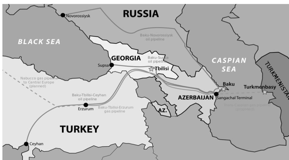
Map 2. BTC Pipeline Route