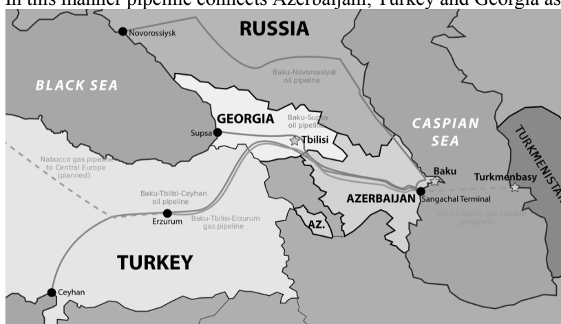
Map 3. BTE Pipeline Route

BTC was the source of inspiration in a way to construct new transport pipeline route, which is known as South Caucasus or Baku-Tbilisi-Erzurum Pipeline (BTE Pipeline). It is a natural gas pipeline that carries natural gas from Shah Deniz gas field in Azerbaijan to Turkey. It has been running parallel to the BTC pipeline. In this manner pipeline connects Azerbaijani, Turkey and Georgia as well (See Map 3).