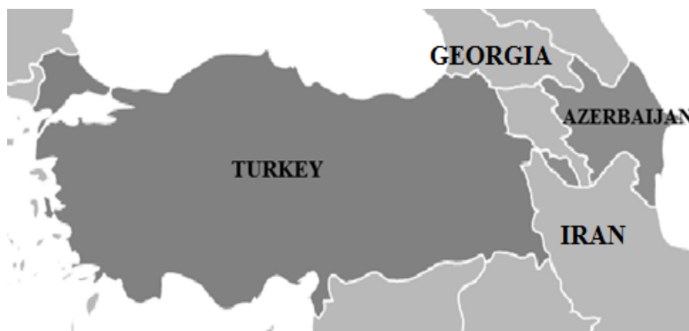
Map 1. Current Borders of Turkey, Azerbaijan, Georgia and Iran

Even if both Turkey and Azerbaijan have closed and brother relations, bilateral trade volume couldn't catch the desired level. Foreign trade of the two countries falls behind its potential due to high tariff rates. In addition to this, the lack of a direct route is an expensive problem. Export of Turkish goods to Azerbaijan is provided via Georgia or Iran that requires high transport fees (See Map 1).