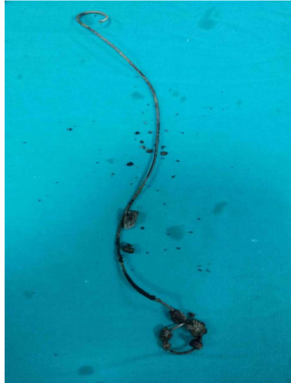
Fig. 2. Appearance of the encrusted double-J stent and all stones.

and the ureteral stent. Care was taken not to disintegrate the stent in the bladder during the Holmium laser (HoL) lithotripsy and the other endourological procedures. The percutaneous suprapubic cystostomy was removed without breaking the stent [Fig. 2].