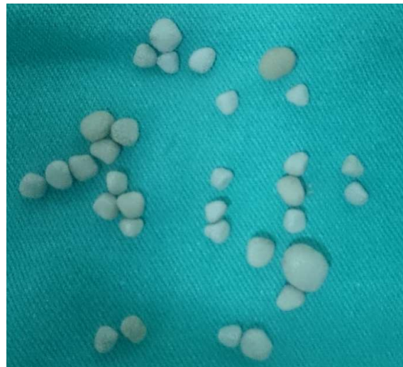
Fig. 3. Removed multiple stones from the ureterocele.

Next, the left ureter underwent the Politano-Leadbetter re-implantation technique. Analysis of the stones showed that their composition was calcium oxalate. In addition, the patient dropped the left kidney stones by the urethral route within one month after