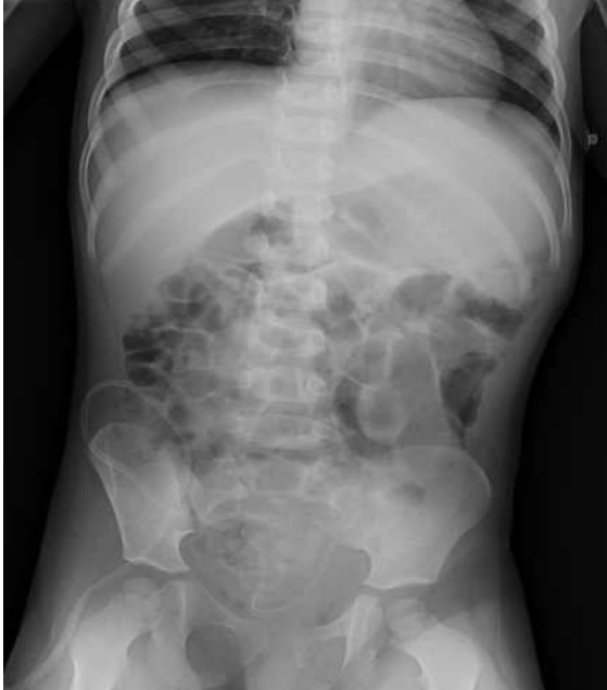
Fig. 4. Plain abdominal radiograph taken after surgery.

surgery [Fig. 4]. The patient is undergoing regular clinical, radiological, and laboratory follow-up for six months, and his general health status is good.