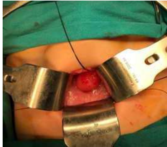
Fig. 2. Ureterocele appearance in bladder.

an irregular surface. After reaching the bladder with a Pfannenstiel incision, the ureterocele was opened by surgical incision, and approximately 20 pieces of stone were removed [Figs. 2, 3].